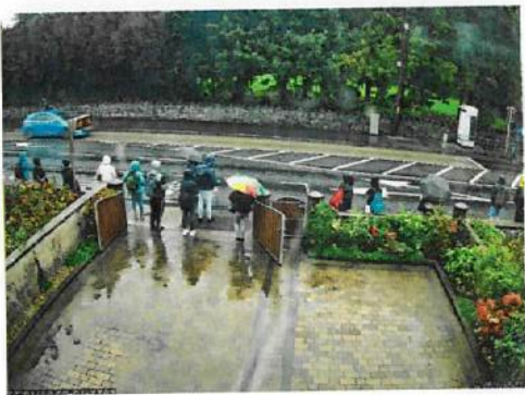
Figure 3: Typical day time crowd