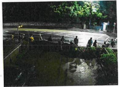
Figure 4: Typical night time crowd