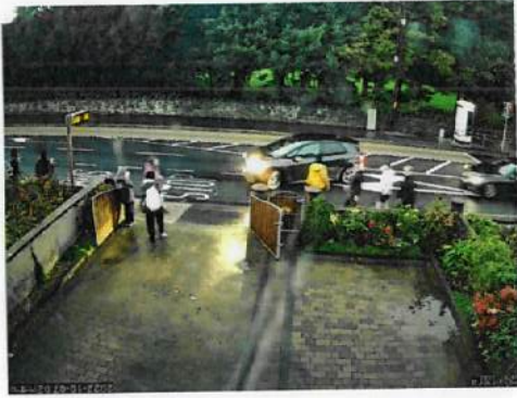
Figure 1: Trying to drive in obstructing traffic.