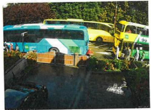
Figure 6: Too many buses