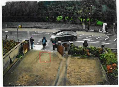
Figure 2: crowds blocking driveway