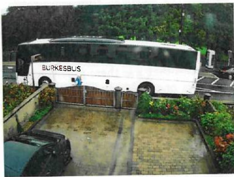
Figure 5: Other company buses